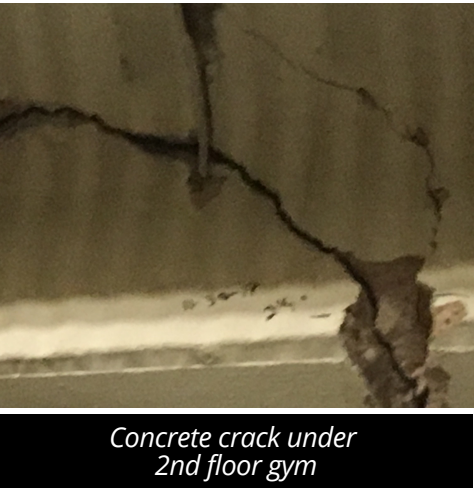
Concrete crack under 2nd floor gym