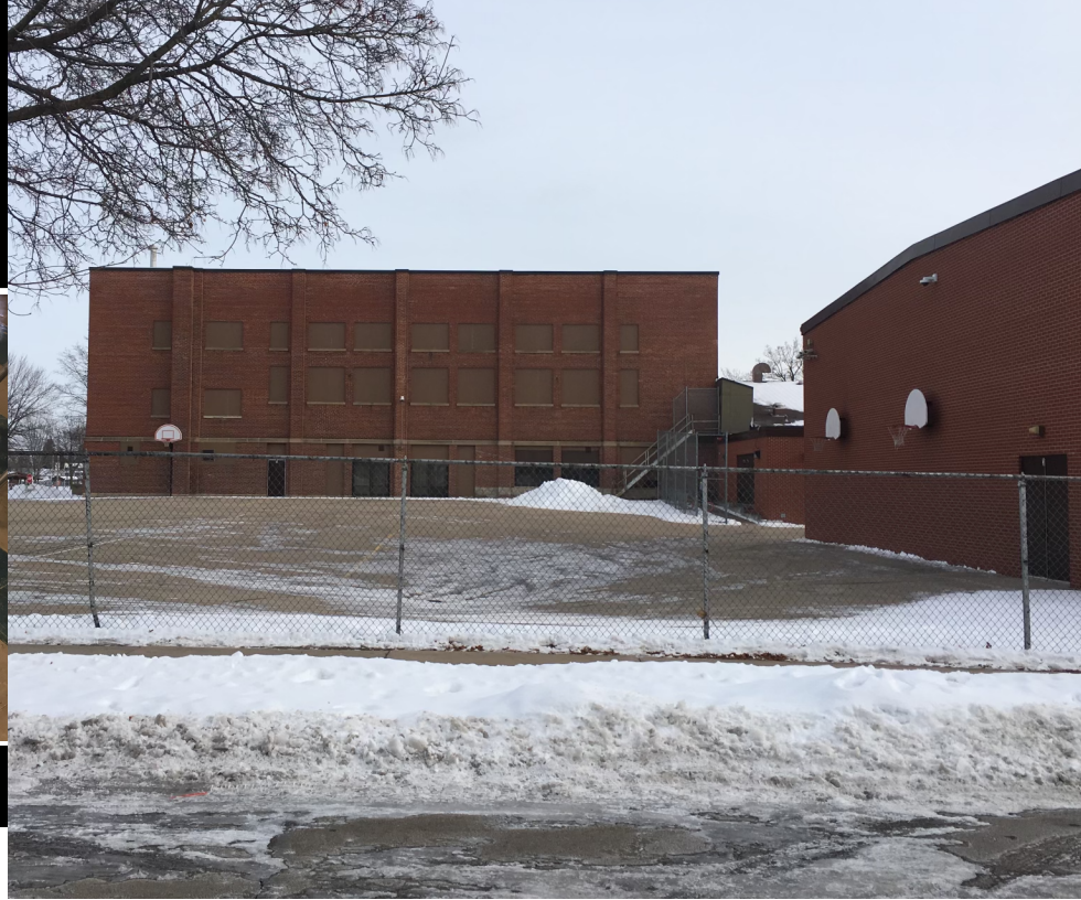
Washington Middle School Playground