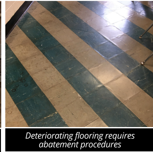
Deteriorating flooring requires abatement procedures