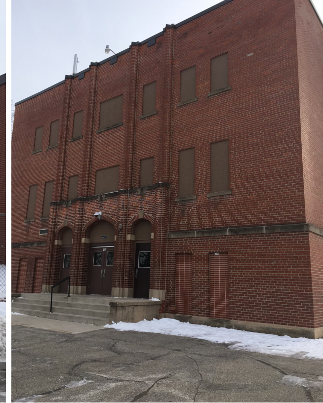
Exterior of WMS

Although our buildings have been well-maintained over the years, the Oconto Falls School District has pressing facility and deferred maintenance needs that we must address soon. These needs go beyond what the district is able to cover through its operational budget on a yearly basis.